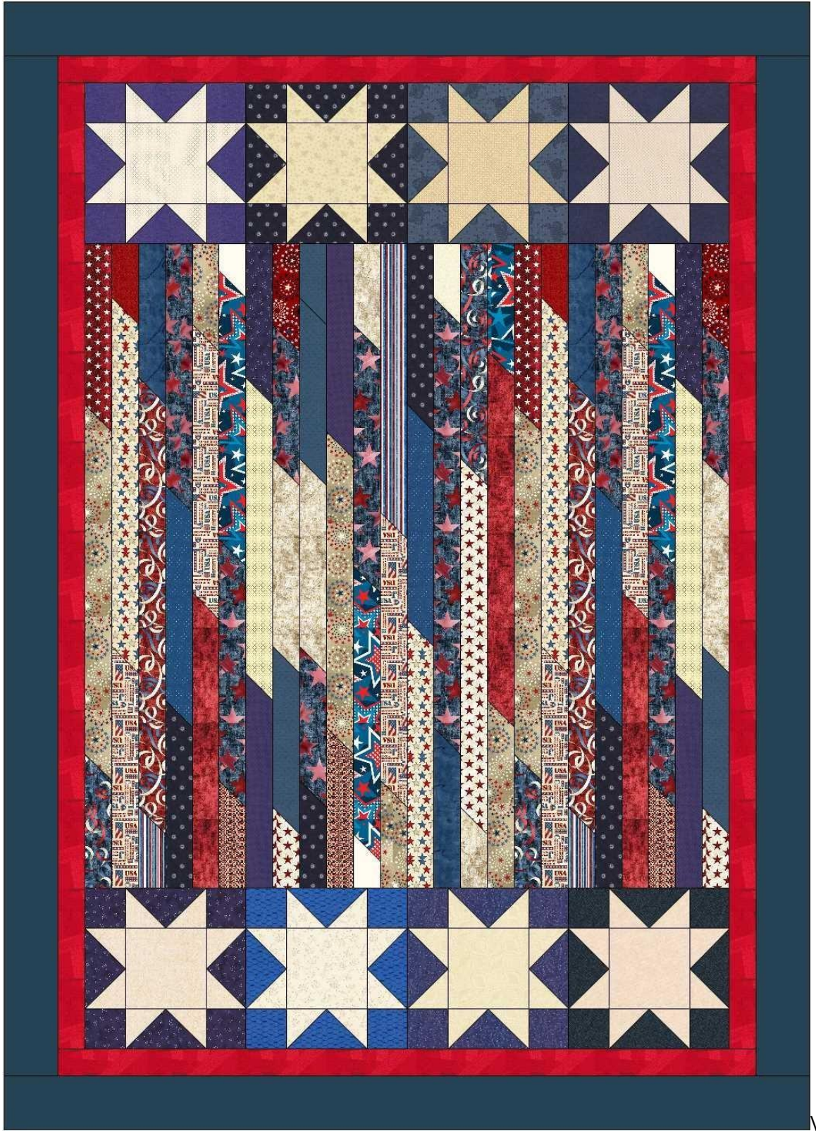
Version with strips turned vertical